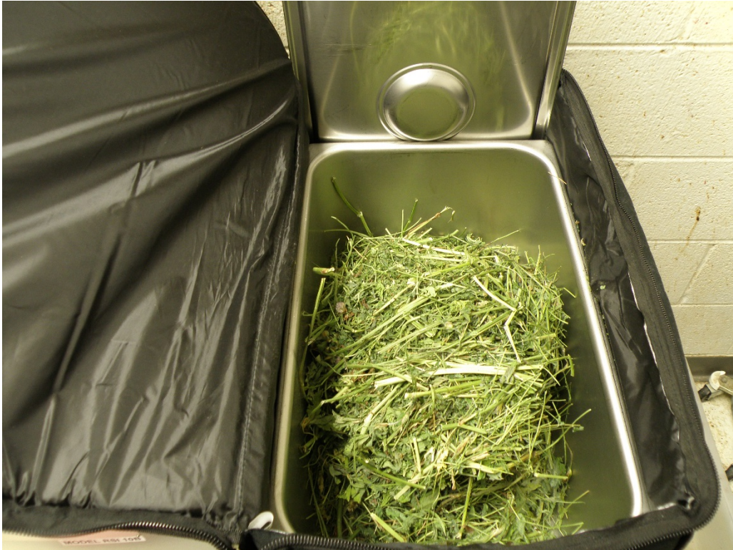
Sample bag content.