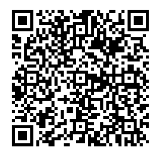
Scan to connect with your Regional Field Coordinator.

These resources are here to help, including 2 new video tutorials!