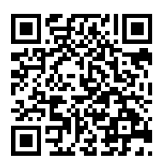
Scan for a FUW project nomination video tutorial.