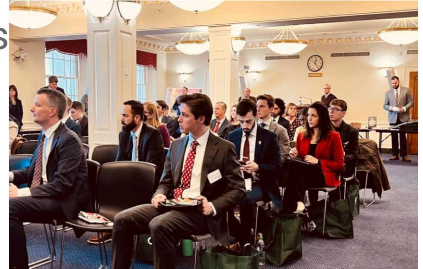
Lunch and Learn Participants, March, 2023