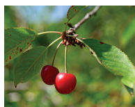
Spotted wing drosophila on fruit crops