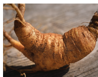
Rusty root on ginseng