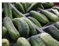
Downy mildew on cucumbers

The NCR team has secured strategies for many pressing regional pest issues, including: