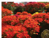
Botrytis on greenhouse ornamentals