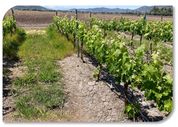
Glyphosate + Indaziflam