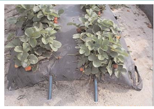
Florida strawberries treated with Chloropicrin in the beds followed 6 days later with Vapam applied at 75 gallons per acre through two drip tapes per bed. This treatment produced excellent strawberry yields equal to the Methyl Bromide/Chloropicrin standard treatment.

funded research has revealed excellent progress and consistently good performance of these products especially when used in combination with other available soil fumigants as part of a program.