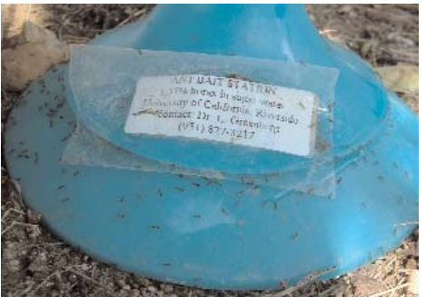
Less toxic bait stations help to rid citrus groves of Argentine ants.

At Riverside Drs. Klotz, Rust and Greenberg spent decades studying the invasive Argentine ant to understand its basic biology and applying this knowledge to practical control methods. Because ant biology is significantly different than many other insect pests the use of bait stations was shown to be the most effective manner of ant control. The cumulative