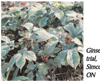
Ginseng trial, Simcoe ON