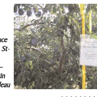
Plum trial in Summerland, BC

Victoria Brookes, Agassiz, BC raspberry application